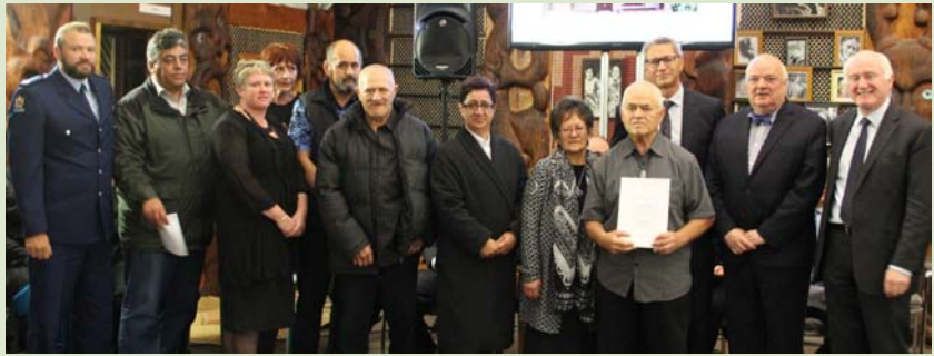
Ōwae Rangatahi Court 26 June 2010, New Plymouth Judge Hikaka