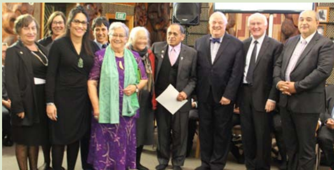
Ōtautahi Rangatahi Court 22 March 2014, Christchurch Judge Taumaunu