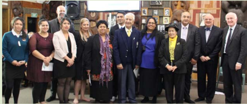
Manurewa Rangatahi Court 23 September 2009, South Auckland Judge Hikaka