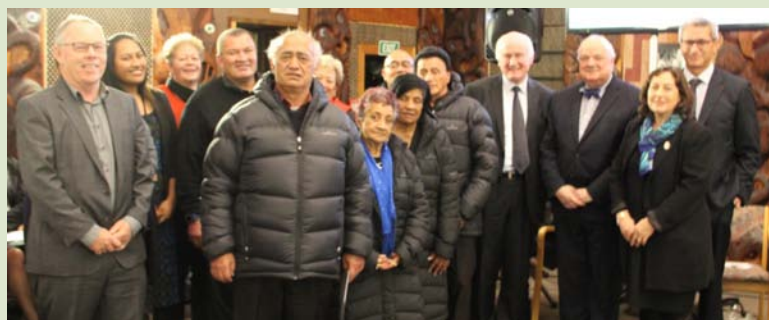
Papakura Rangatahi Court 1 October 2011, South Auckland Judge Eivers