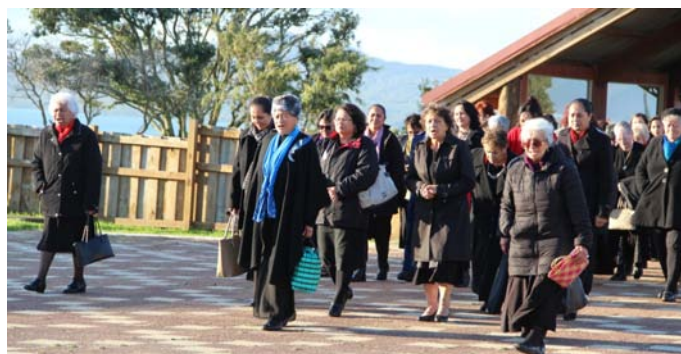
Pōwhiri at the AIJA Award Ceremony.

Otira tēnā tātou i ō tātou tini aituā, i ō tātou tini mate, ko rātou te hunga wairua kua whetūrangitia. E hika mā, there are many elders who are now no longer with us