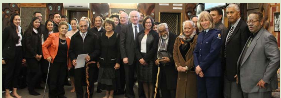
Tūwharetoa Rangatahi Court 5 December 2015, Taupō Judge Wills