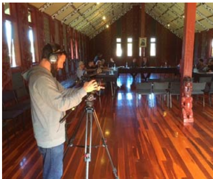
Image from the production of Ngā Kōti Rangatahi o Aotearoa.