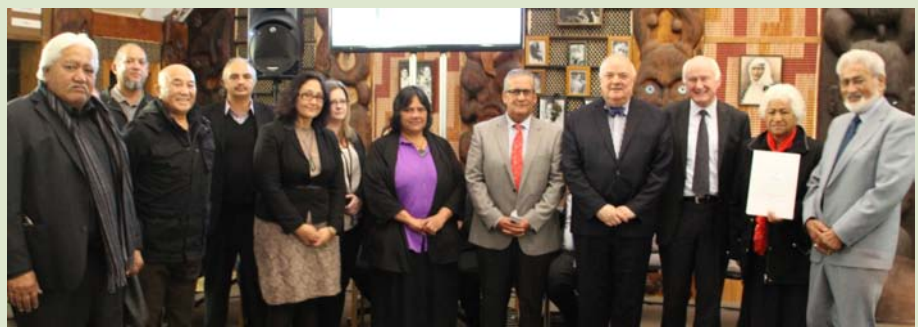
Mātaatua Waka Rangatahi Court 11 June 2011, Whakatāne Judge Bidois