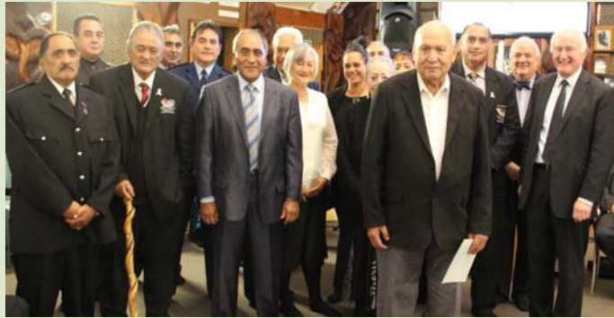
Te Arawa Rangatahi Court 2 December 2011, Rotorua Judge Bidois