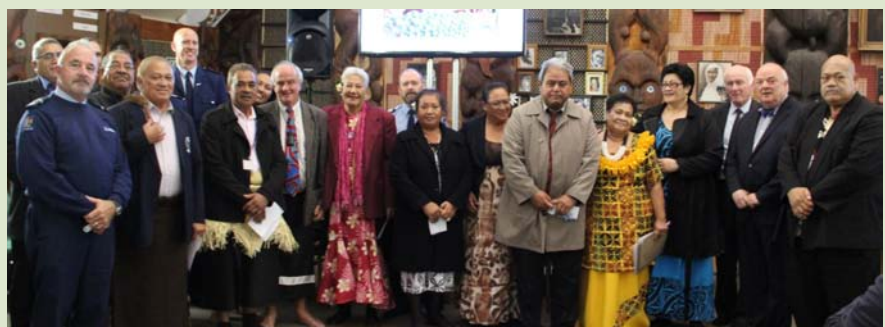
Avondale Pasifika Youth Court 30 September 2011, Auckland Judge Malosi