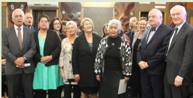
Tauranga Moana Rangatahi Court 14 March 2015, Tauranga Judge Bidois