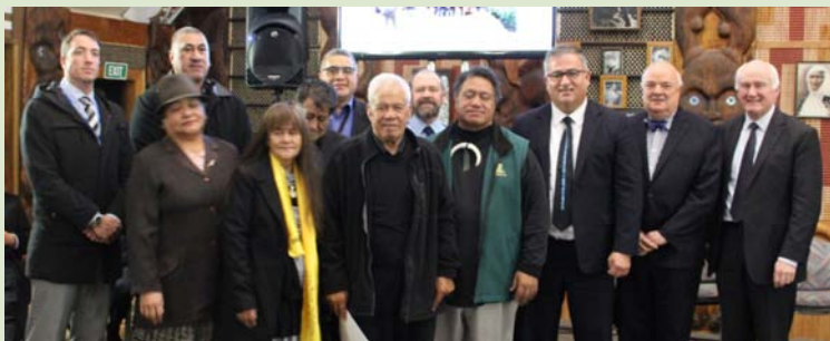
Māngere Pasifika Youth Court 22 June 2010, South Auckland Judge Malosi