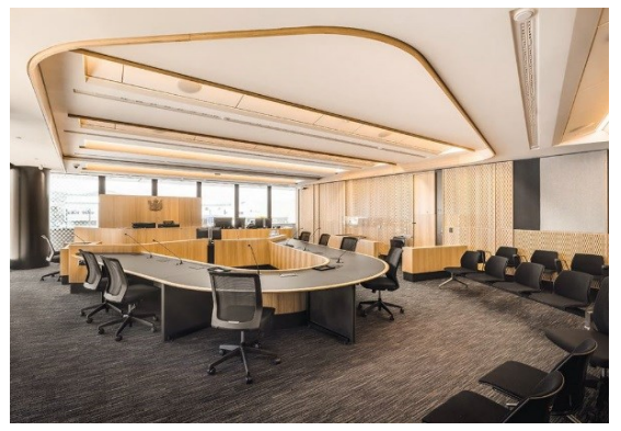
The new Christchurch Youth Court

We are seeing a very large number of children with neuro disability as I am sure you are. The prevalence rates for those children in conflict with the law are significantly greater than in the general child population.