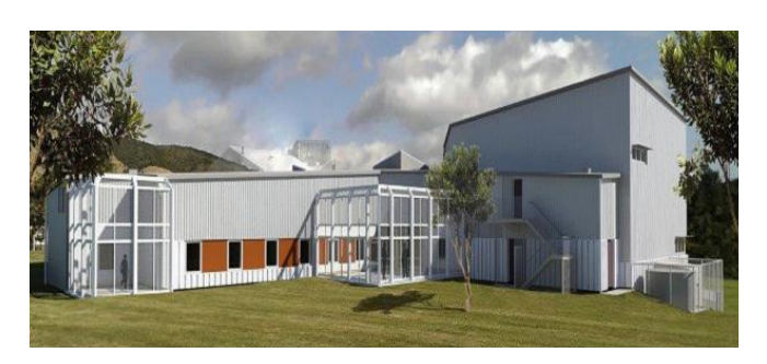
A view of Ngā Taiohi

Nga Taiohi (meaning "our youth"), the national secure youth forensic mental health inpatient unit, was opened in April 2016. The unit is part of the continuum of youth forensic mental health and alcohol and other drug (AOD) services for children and young people who are involved with the Youth Justice system and who have mental health (or mental health and AOD) problems. Most youth forensic services are community based and provide a range of screening, assessment and treatment services in youth courts, youth justice residences and community settings nationwide. It is important to provide interventions in the least intrusive way and as close to home as possible, consistent with maintaining community safety. Effective community youth forensic services reduce the need for inpatient interventions.